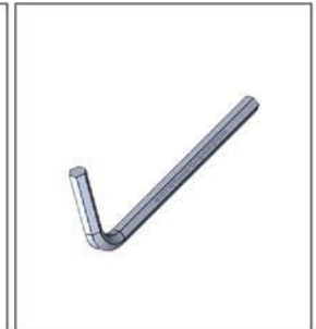
Allen-key : 1 Pcs

Step 1 : Turn table top upside down over on a to a clean carpet as shown in fig. 2.