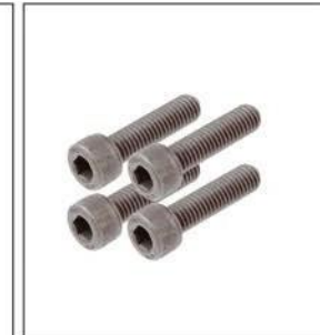
Bolts:4+2 pcs Washer :4+2 Pcs